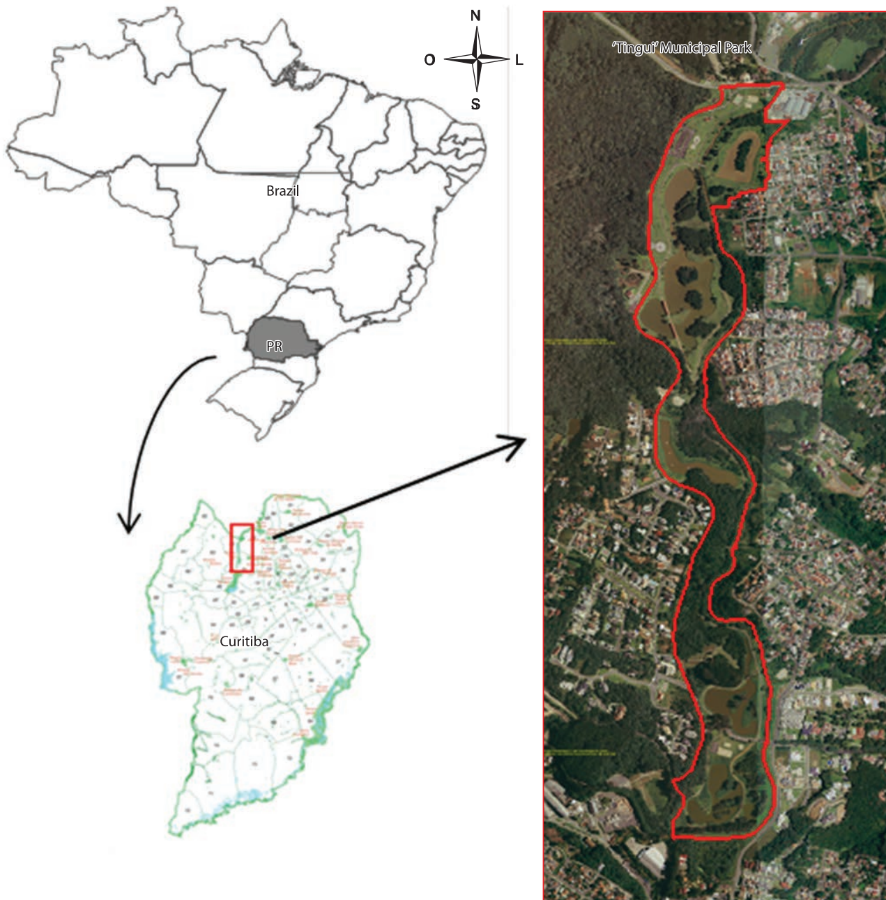
Figure 1. Location of 'Tingui' Municipal Park.

The park is 2,182 m long and from 66 to 333 m wide, forming an elongated structure from north to south. Barigui River borders the east and south limits of the park, while Fredolin Wolf and Jose do Valle streets contour the north and west limits, respectively.