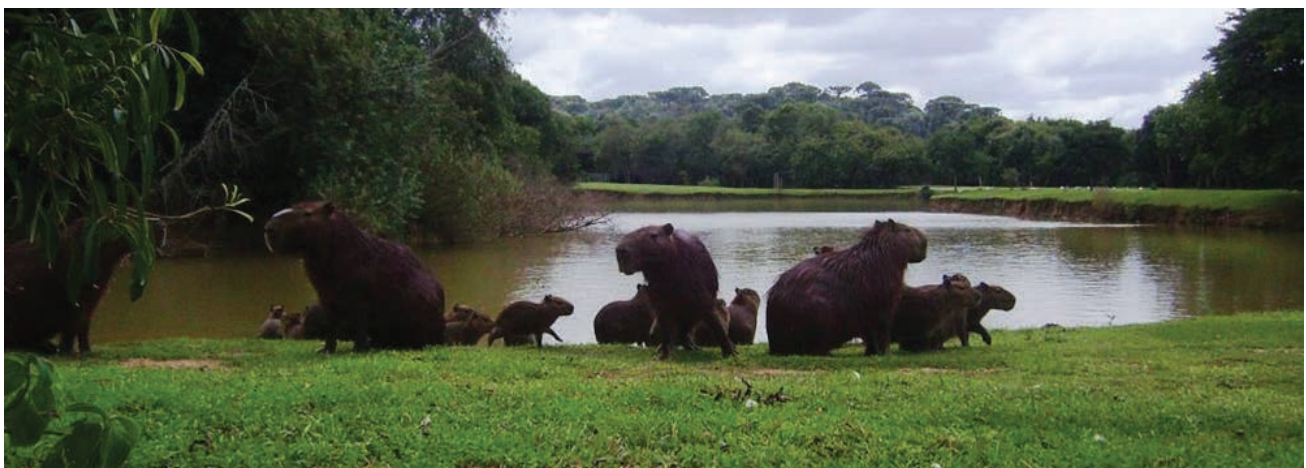
Figure 2. View of a group of capybaras at 'Tingui' Municipal Park, 2009.